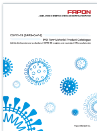
Raw Materials Product Catalogue for COVID-19/SARS-CoV-2